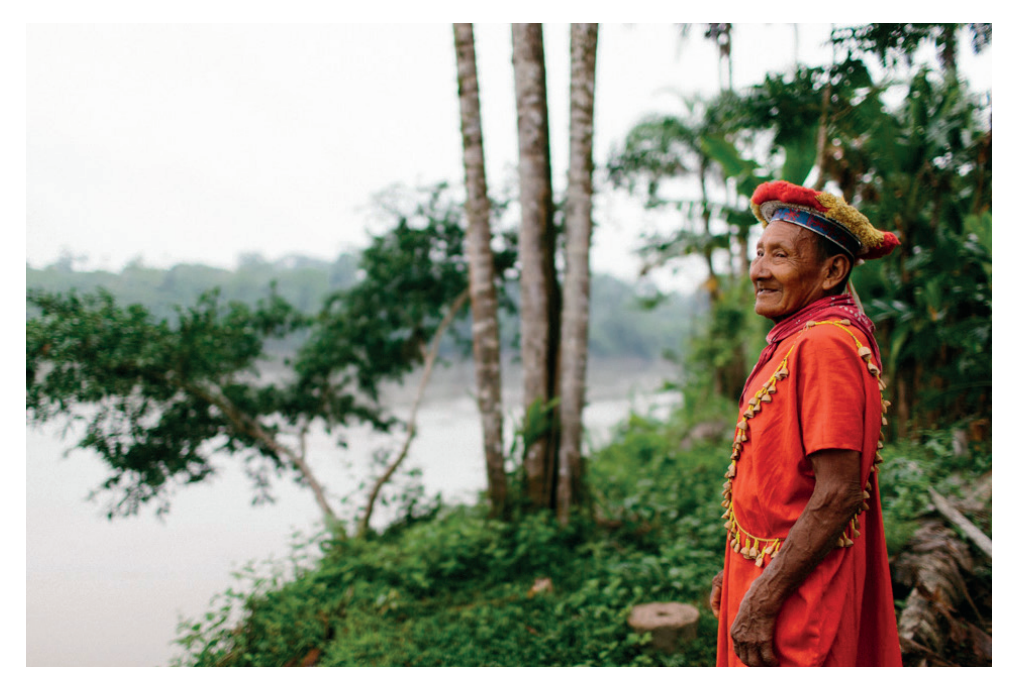
Secoya-Siekopai shaman in the community of San Pablo along the Aqua Rico river