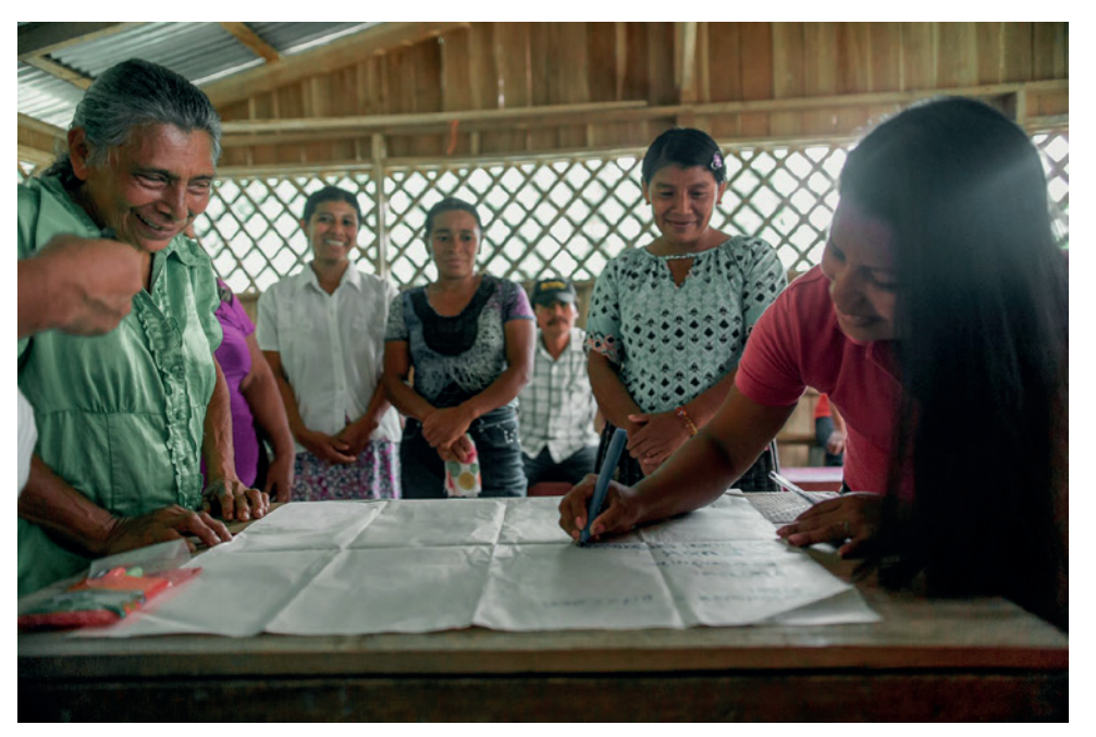
Women's empowerment workshops in Orochico in the Talamanca rainforest

Energy access is gendered. Women use and benefit differently from access to electricity. The renewable energy component is built upon an integral women's empowerment approach that beyond creating clean energy access supports and strengthens women to become leaders, advocates, and agents of sustainable and future-oriented change in their communities and beyond.