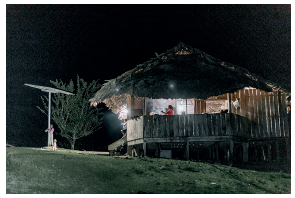
Cabécar house illuminated by the new solar home systems in Talamanca

The Initiative combines the use of smart regenerative technology and intensive capacity building programs along with an alternative and cultural-sensitive payment model. So far, we have completely solar-electrified 33 remote rainforest communities in five different Indigenous territories in four countries and empowered six Indigenous Nations that together guard and protect more than 4.5 million hectares of pristine rainforest territory.