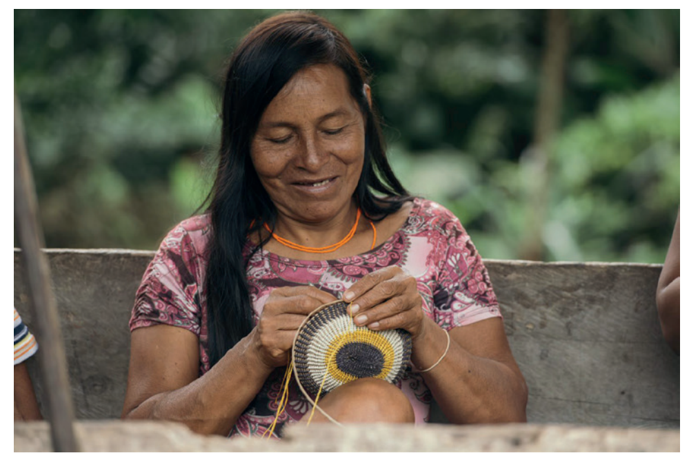
Woarani woman working on traditional handicrafts in Acaro in Ecuador's Amazon