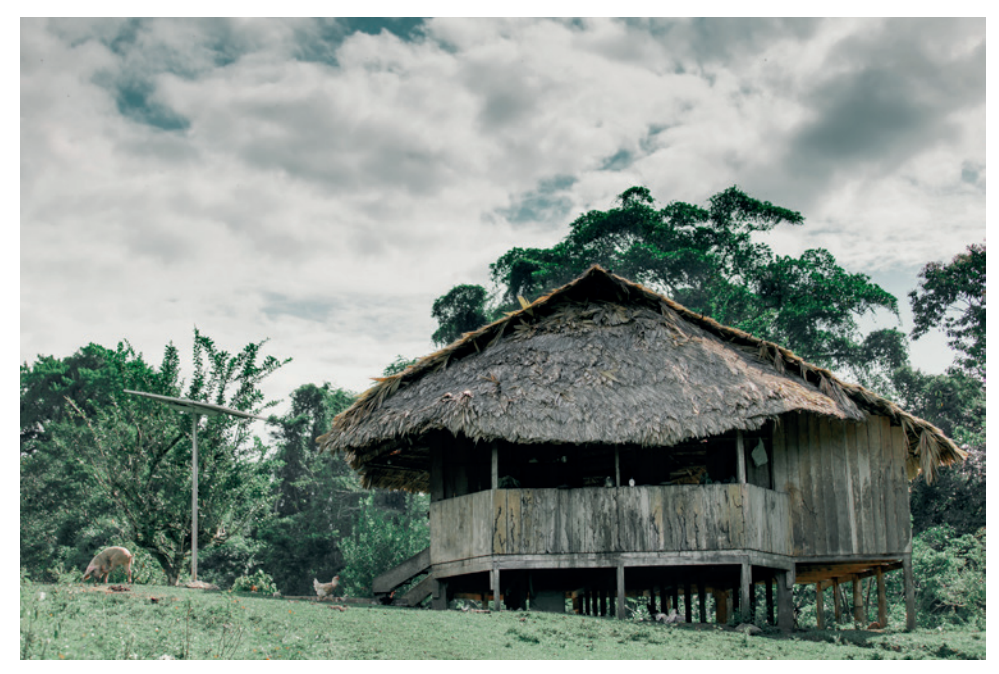
Traditional Cabécar house with solar home system in the Talamanca rainforest

Creating sustainable access to clean, safe, and independent solar energy is a cornerstone to poverty eradication, health, education, gender equality, livelihood and general quality of life, as well as a catalyst for local empowerment and self-determined development. Many of the Sustainable Development Goals (SDGs) hinge on the ability to create energy access for all and to specifically target those people and communities who are currently left behind.