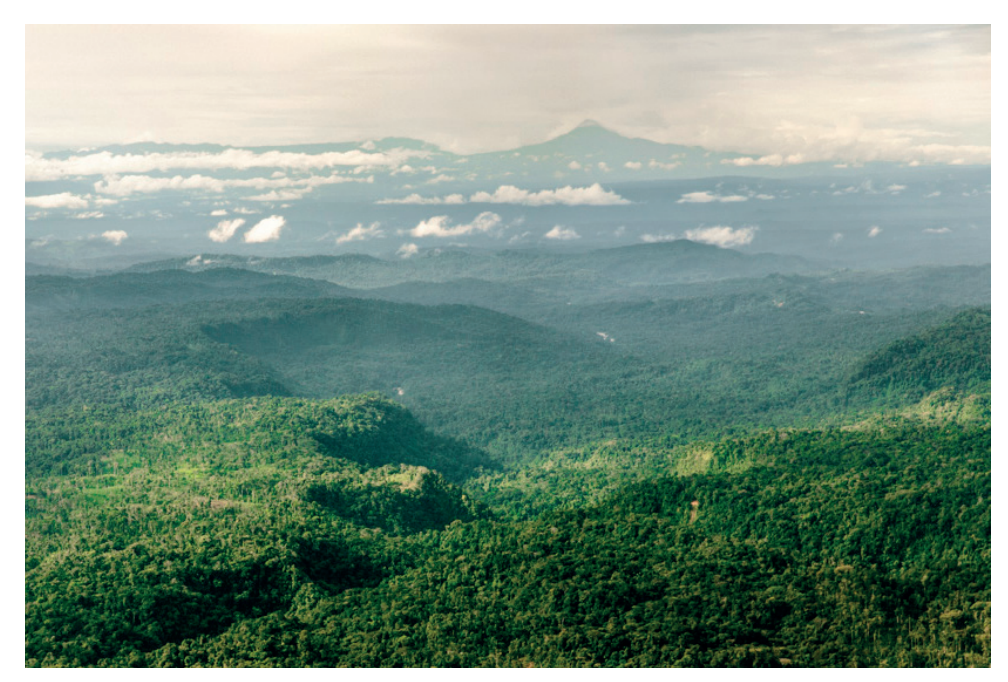
North-eastern Amazon rainforest of Ecuador

The regional Initiative in Latin America ensures the conservation of ecosystems and protects the biological and cultural diversity in megabiodiversity hotspots in the Amazon rainforest of Ecuador, Colombia, and Peru as well as in the Talamanca rainforest of Costa Rica. In direct partnership with six Indigenous Peoples, the initiative combines nature-based, innovative, and traditional approaches for biodiversity conservation with the creation of sustainable access to clean, safe, and independent solar energy.