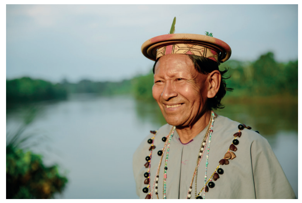
Secoya-Siekopai elder from the community of San Pablo in the Ecuadorian Amazon

At the intersection of effective climate action and the recognition of indigenous rights, the initiative follows a holistic bottom-up approach based on the self-formulated vision and historical cooperation of six Indigenous Peoples, including the A'i Kofan, Secoya-Siekopai, Siona, Waorani, Cabécar, and BriBri, who together protect more than 4.5 million hectares of primary rainforest in Central and South America.