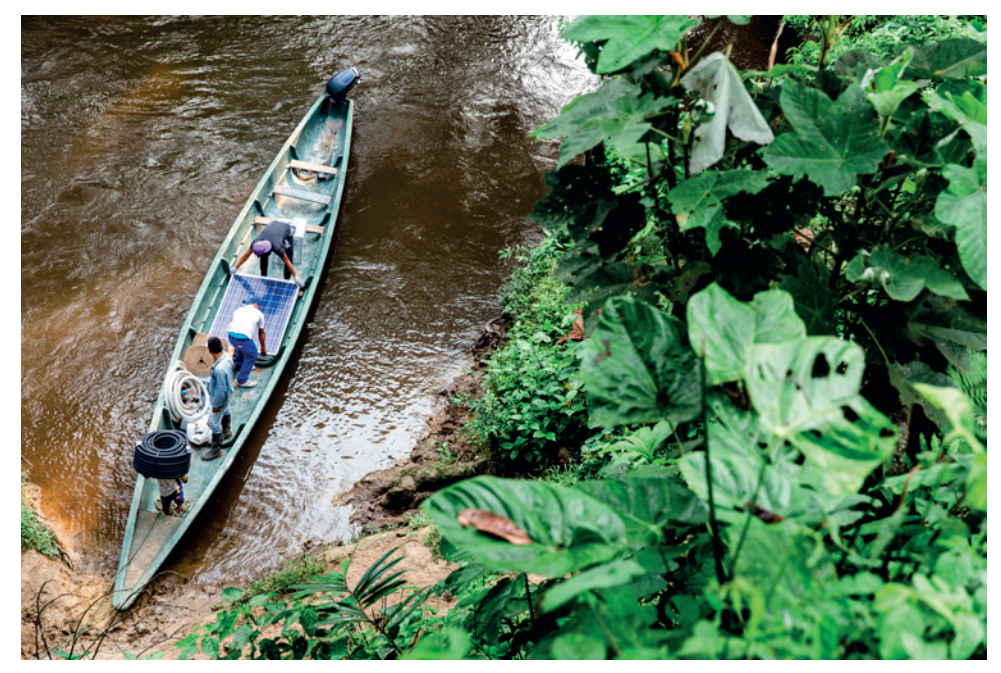
Transportantion of solar system materials in the Amazon rainforest

LOVE FOR LIFE focuses on precisely this goal to create sustainable and clean energy access for the most vulnerable and hardest to reach people. In particular, LOVE FOR LIFE has proven to successfully implement holistic, community-led solar energy projects in the most remote places on Earth by building local capacities and strategic partnerships for long-term project sustainability.