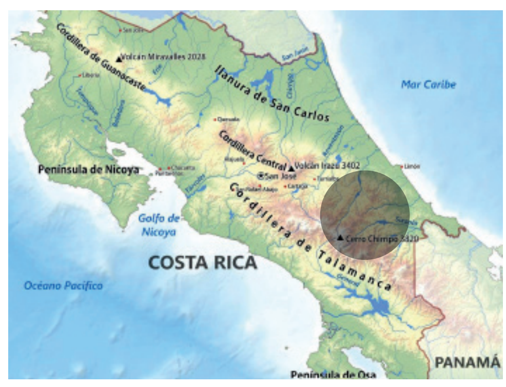
Cabécar-Bríbri rainforest territories where the solar energy initiative is implemented in partnership with ADITICA