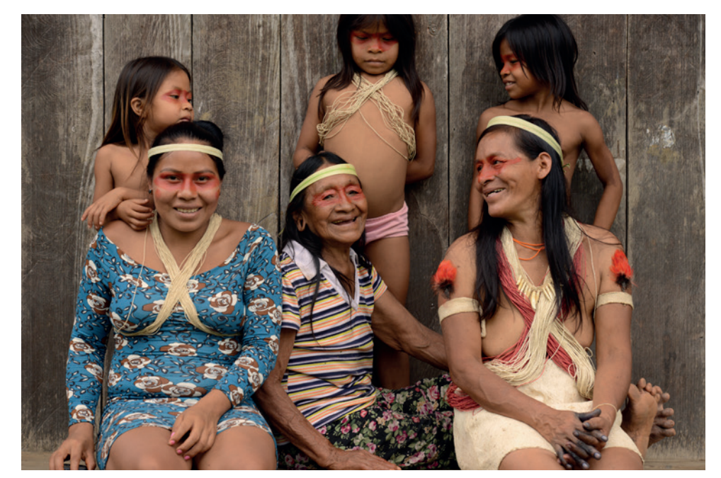
Four generations of a Waorani family in the rainforest community of Acaro, Ecuador

Tropical forests are among the most species-rich ecosystems on the planet. Although they cover less than 10% of the global surface, more than half of the world's flora and fauna live in them. They are crucial for the water and carbon cycle and serve as an important carbon sink. According to the Global Forest Resources Assessment of 2020, there are only about 1.11 billion hectares of primary forest left on Earth. Although, Indigenous Peoples play a key role in global biodiversity protection and effective climate action they have received only marginal attention in national and international strategies and projects.