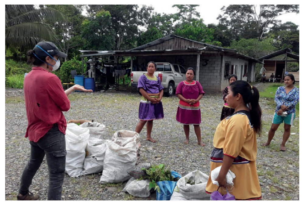
Local food and seed packages for A'í Kofán families in Ecuador's Amazon rainforest