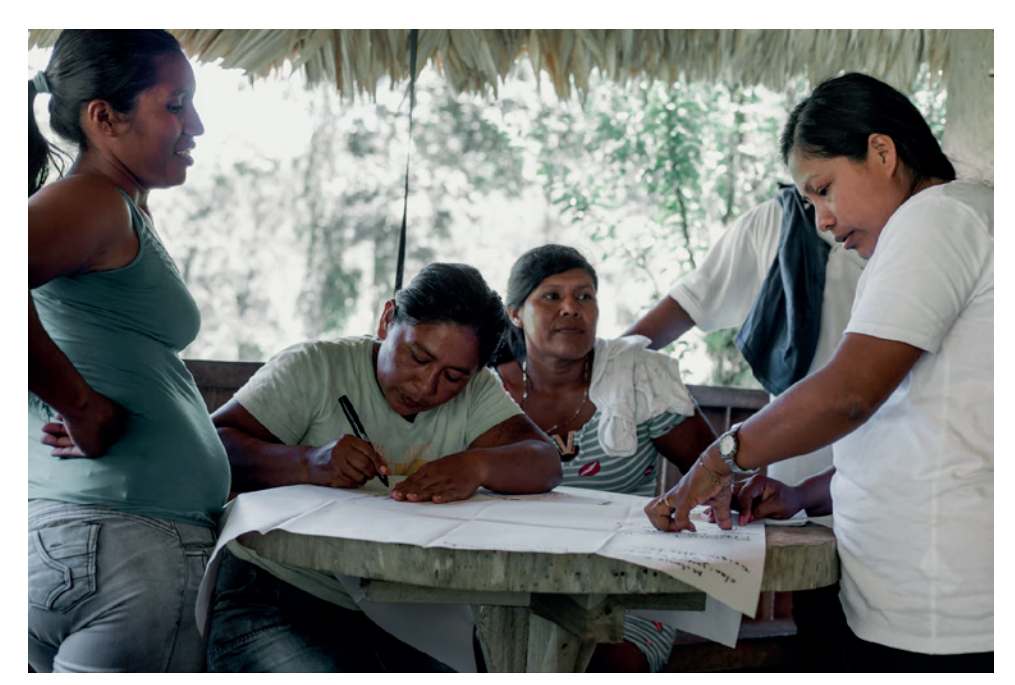
Women's empowerment workshops in Arenal in the rainforest of Talamanca