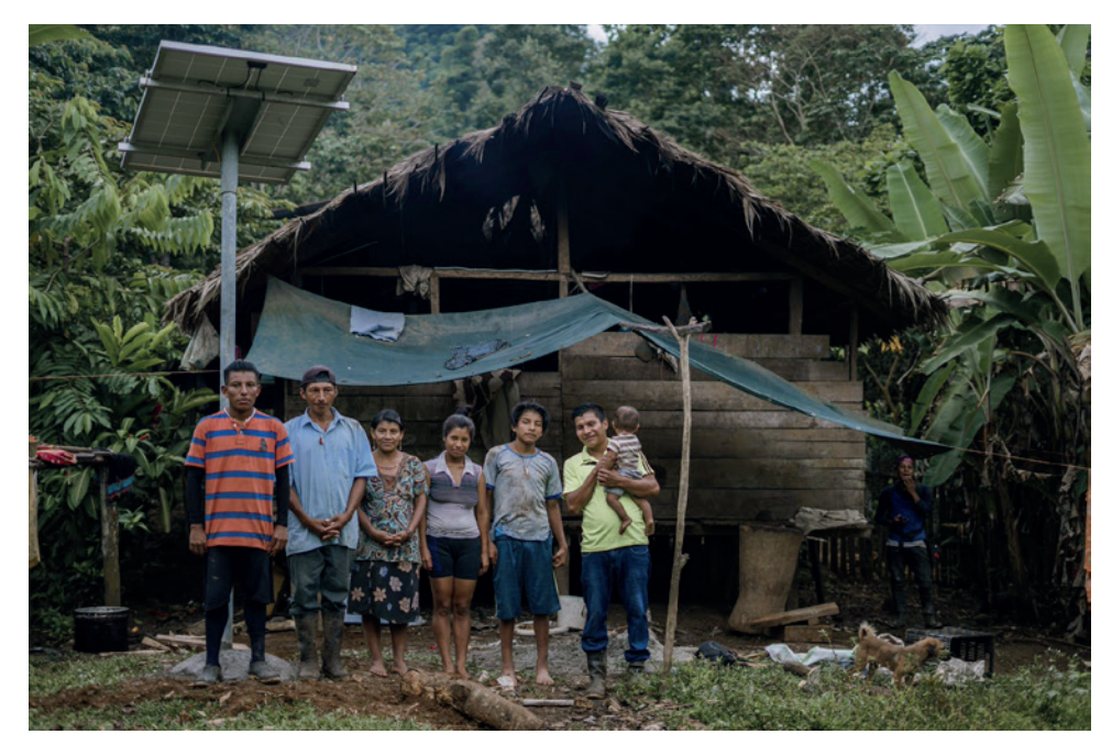
Cabécar family in the community of Orochico in the Talamanca rainforest