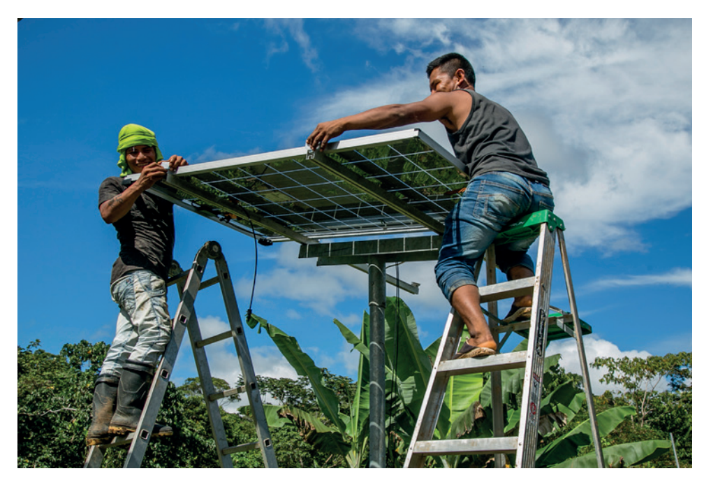
Solar home system installation in the community of Mañoko in the Peruvian Amazon