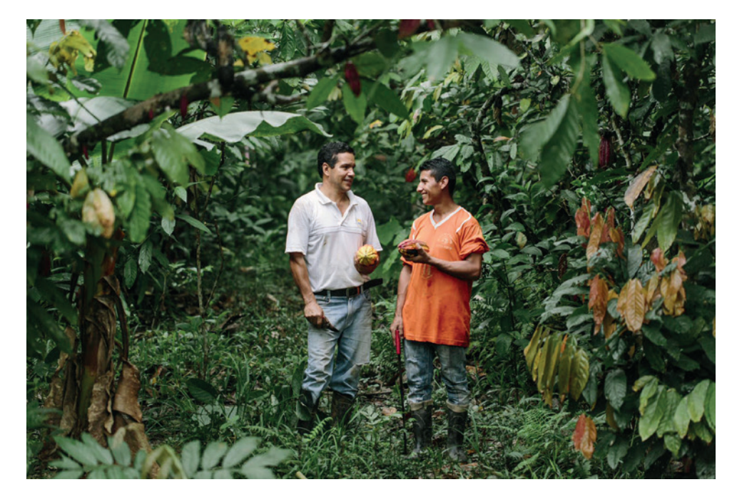
Restored jungle in previously contaminated rainforest area in north-eastern Ecuador

And more recently, LOVE FOR LIFE together with its local partners in Costa Rica and Ecuador has set up action plans towards nature-based and Indigenous-led solutions to respond to the COVID-19 crisis. As part of these plans, in the last three months, 400 Indigenous families in Talamanca and the Amazon rainforests have been able to have access to local food by reviving ancestral practices, cultivating and safeguarding native seeds and strengthening their own local production systems.