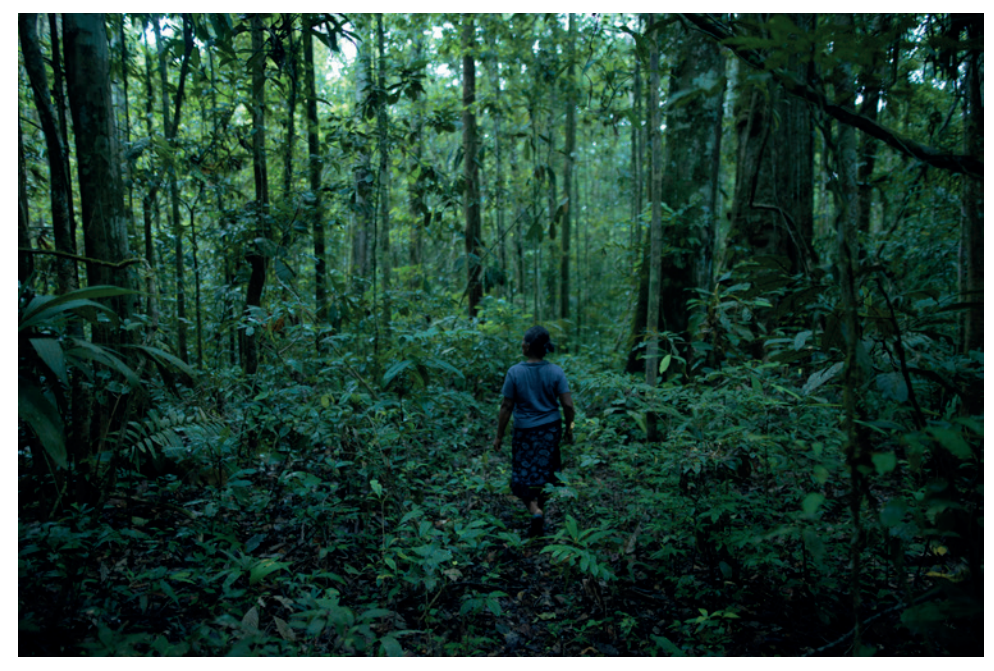
Secoya-Siekopai woman from the community of Mañoko in Peru