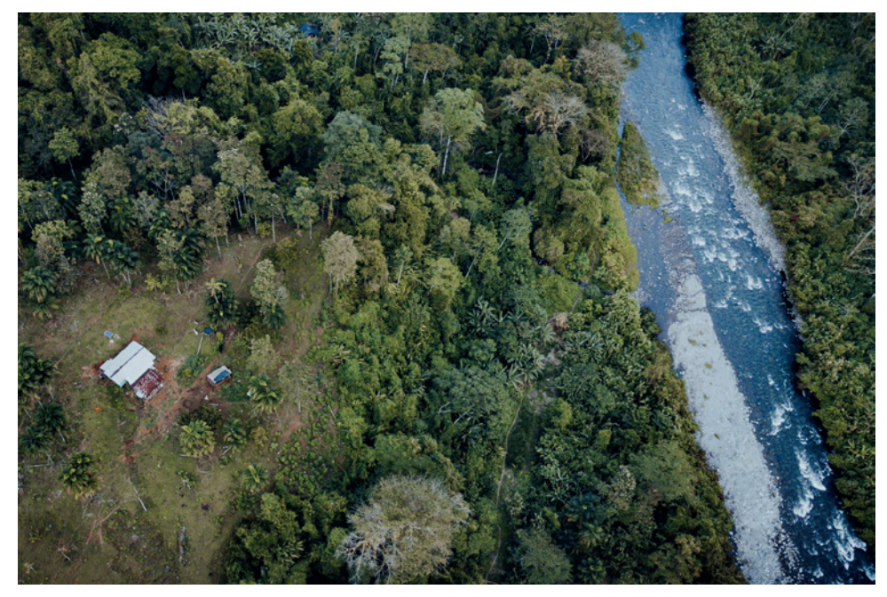
Cabécar territory in the Talamanca rainforest in Costa Rica

The north-south and south-south collaboration as well as the multistakeholder approach of the initiative show to what extend the implementation of biodiversity protection, climate action, and sustainable development goals can succeed through the exchange of knowledge and in direct partnership with Indigenous Peoples, civil society as well as public and private actors.